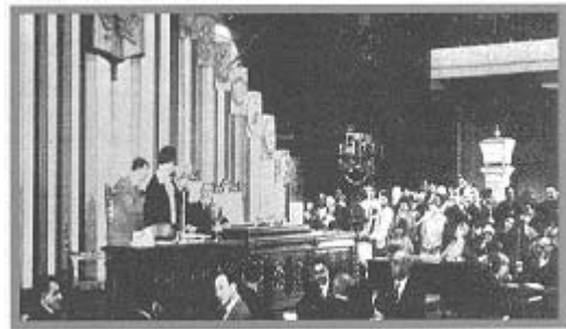
Doris Stevens, in her historic address to the Sixth International Conference of American States in Havana, calling for the recognition of women's rights in the Americas (1928)

Frustrated at being excluded from participation in the Second Pan American Scientific Conference (Washington, D.C., 1915-1916), a group of prominent women formed a parallel Pan American Women's Auxiliary Conference, which after meeting for several months concluded that, in order to advance the cause of women's rights in the Americas, a Pan American