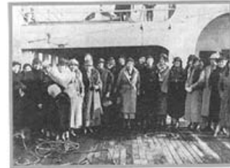
As Doris Stevens, President of CIM, traveled to Montevideo by ship, she gathered supporters and members of the Commission who attended the Seventh International Conference of American States (1933)

The Commission achieved its objective so well that the delegates at the 1933 conference were astounded. The constitutions and the laws of the twenty-one American republics were examined, principally in regard to the inequality of rights. The Commission presented to the Seventh Conference printed monographs analyzing the legal status of women in each of the twenty-one countries. Summaries of the laws pertaining to women and their limited civil and political rights in each one of the American republics, in the official language of their respective countries, were presented in compliance with the resolution of the Fifth International Conference of American States of 1923. Prepared exclusively by women, they were the first studies of this nature in the world. The Inter-American Commission of Women also recommended the adoption of draft treaties on the equality of rights and the nationality of women.