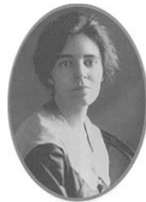
Alice Paul, leader of the National Women's Party (United States)